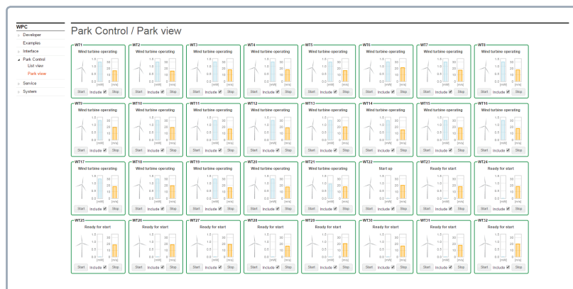
Example of Park Control Overview allowing the user to start and stop individual turbines.